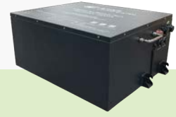
SMART LITHIUM 210AH TRAVEL 60-80 MILES (97-129 km)

*Different passenger configurations and terrain will affect maximum travel distance.