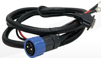
2CR020 - Harness for Lithium On-Board chargers for 2CH020 charger