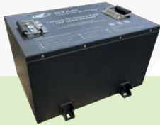
SMART LITHIUM 80AH TRAVEL 15-25 MILES (24-40 km)

The actual distance you can travel in an electric vehicle is determined by the load you put on the electric motor. Larger and heavier cars will use more energy. Lifted vehicles will use more energy because of the additional weight and larger tires. Adding passengers and uneven terrain will increase the load on the motor. The opposite is true as well. If you lighten the load on the vehicle it will travel farther. The following ranges are based on a 2-passenger vehicle traveling on flat ground.