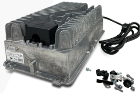
2CH020 - Charger Lester Summit II 48V, 1050W, 22A, universal AC with cord for STAR Lithium Battery. 2BT287, 2BT288 or 2BT289, 2BT290