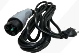
2CR910 - AC Charger Cord with Yeeda Plug for SIRIUS or Capella 110V or Classic. 2BI805, 2CB800