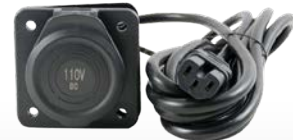
2RC080 - AC 110V Charger Receptacle with cord for ON BOARD Chargers only. 2CH913, 2CH917, 2CH918