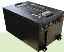
SMART LITHIUM 105AH TRAVEL 30-40 MILES (48-64 km)