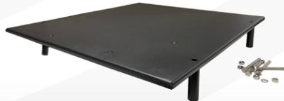
2BT800 - Battery Mounting plate and hardware. 2BT801