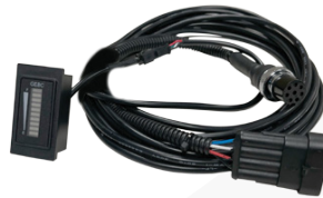
2MT223 - Battery indicator, meter with 10 LED bars AND wire harness. 2SW800 or 2MT800