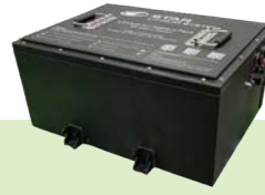
SMART LITHIUM 160AH TRAVEL 45-60 MILES (72-97 km)