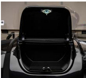
Locking insulated trunk with drainable cooler