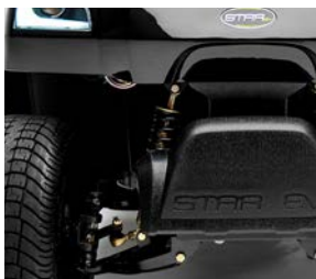
Independent suspension with double A-arms