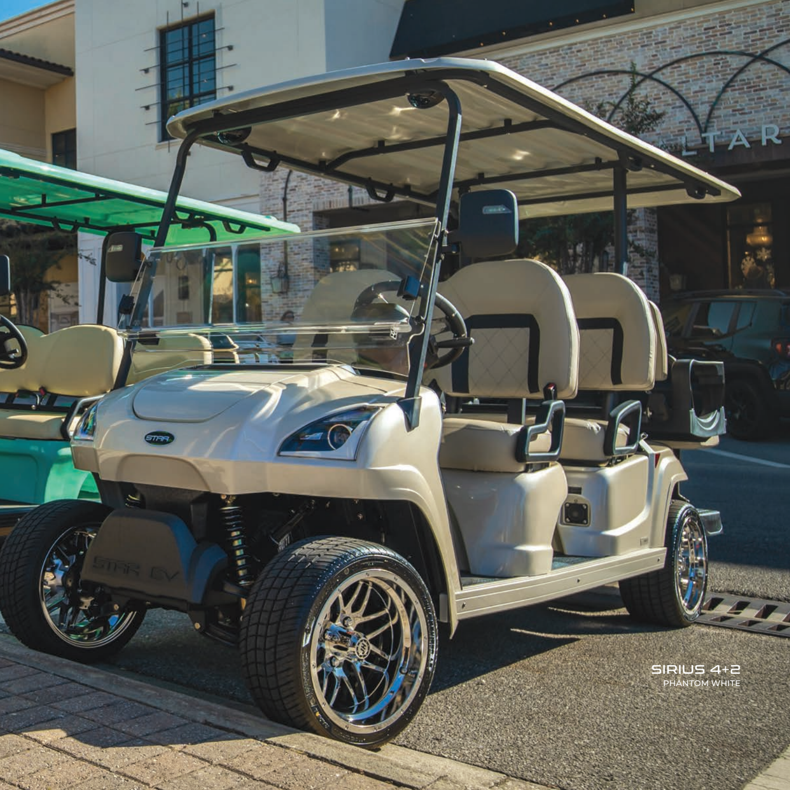
SIRIUS 4+2 PHANTOM WHITE