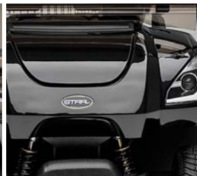
Premium automotive paint and color matched roof