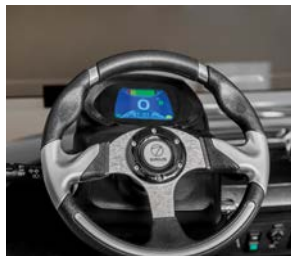
Automobile style full color display