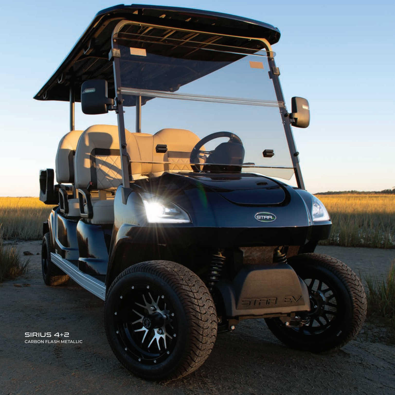
SIRIUS 4+2 CARBON FLASH METALLIC