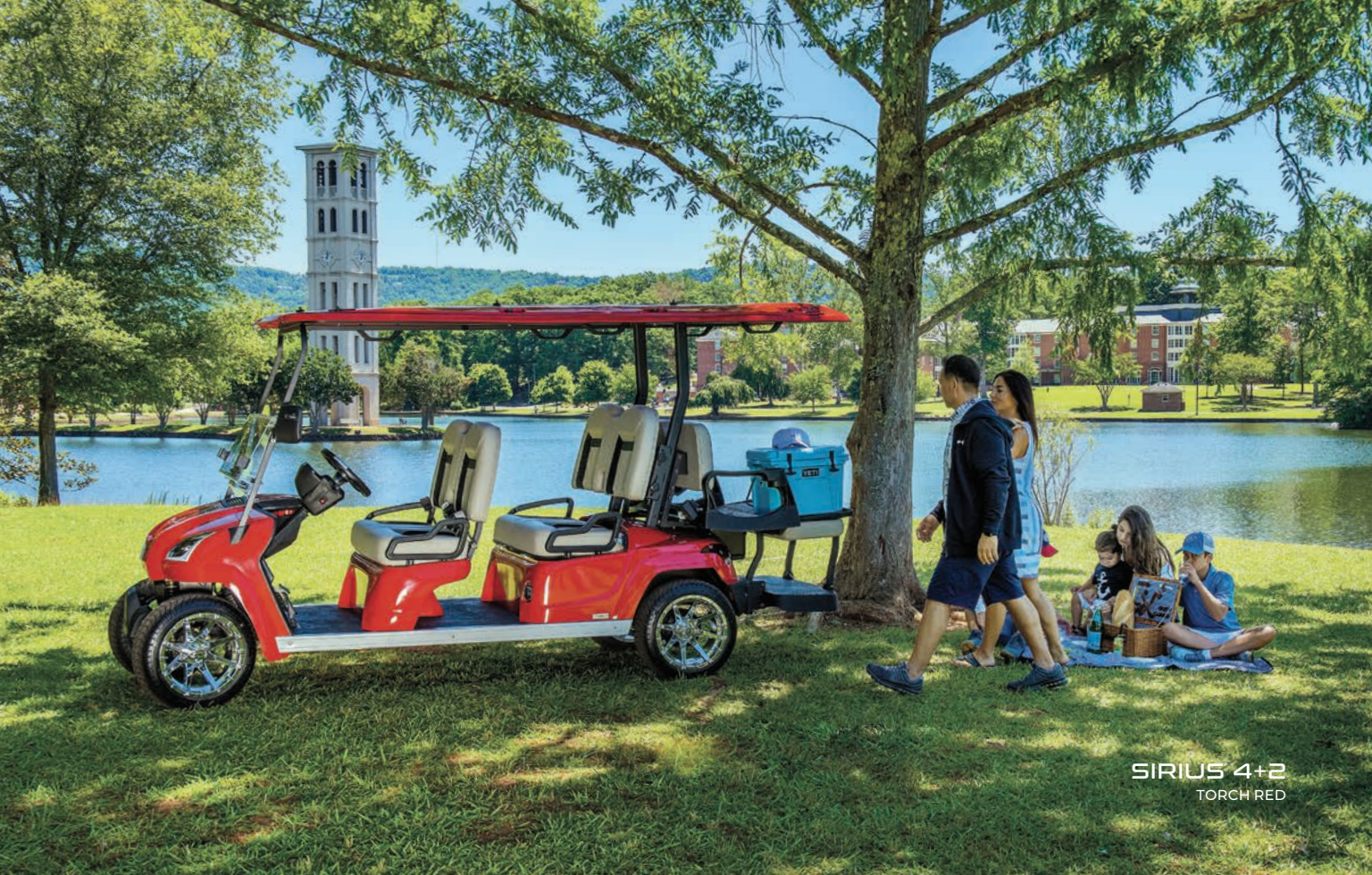
SIRIUS 4+2 TORCH RED