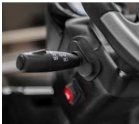
Self cancelling integrated turn signals