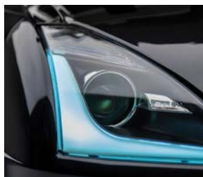
LED headlights with daytime running lights