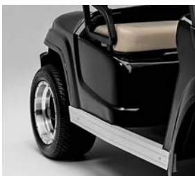
QDS™ Quiet Drive System with temperature protection