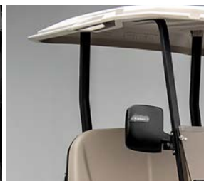
Corrosion resistant aluminum roof support system