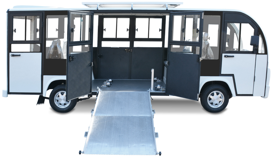
BN72-11-D WHEELCHAIR ACCESSIBLE