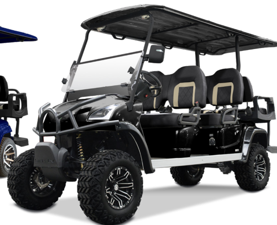
SIRIUS 4+2 LIFTED

Specifications are subject to change without notification.