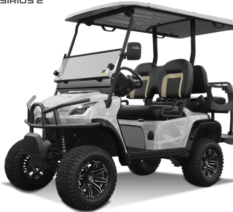
SIRIUS 2+2 LIFTED