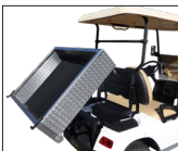
Dumping Utility Box